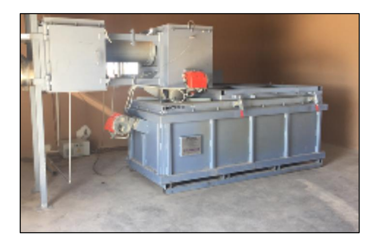
Figure 8: Other Supply Chain Management Activities included in Amendment 1 to the Financing Agreement - Incinerator.

UNDP supported the Zambia Medicines Regulatory Authority (ZAMRA) with the installation of 2 Incinerators at the ZAMRA premises. UNDP constructed an incineration compound that houses an incineration shed, offices, waste sorting areas, waste pit and other conveniences.