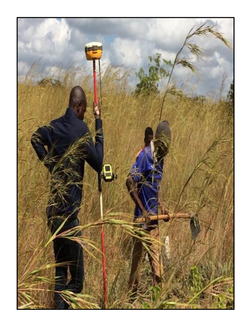
Figures 9 and 10: Topographic survey done in Chimoio.