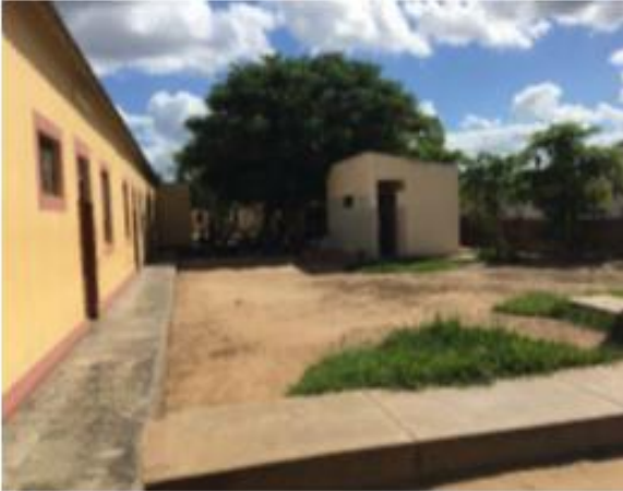
Figures 1 and 2: Patients waiting at the shadow of a tree in Health facility of Chalucuane, Gaza province, selected for the construction of a TB waiting area/shelter.